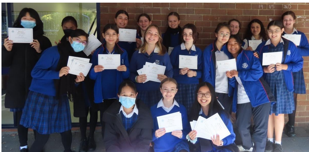
Above: Year 8 Bronze Recipients