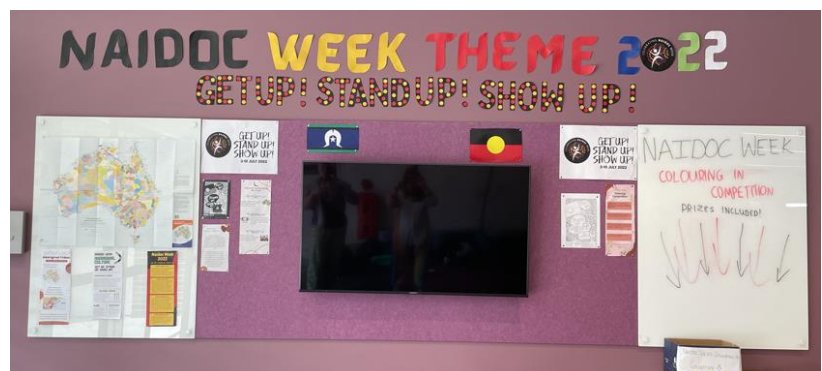
NAIDOC display in K Block

The Assembly ended with some words from Ms Scalese, acknowledging that life is not about one moment in time, but a combination of ongoing events and actions.