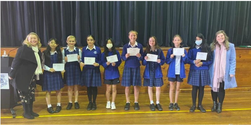
Year 7 (left and below)