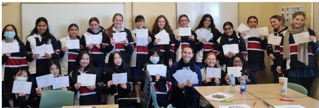
12.3 Bronze Award Recipients