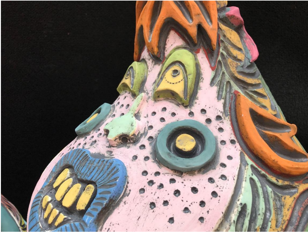
Emma F, Sideshow. Ceramics (detail)