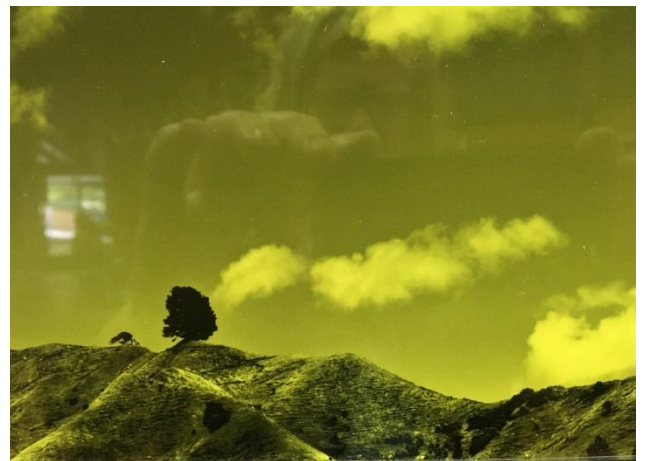
Ella C...---... (SOS). Photomedia (detail)