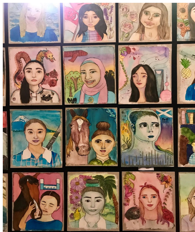
Year 8 'Australian Stories'