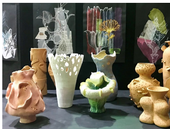
Year 11 ceramics