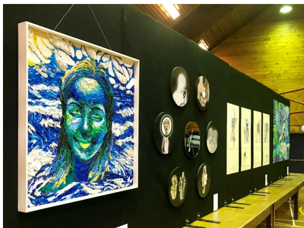
View of the exhibition