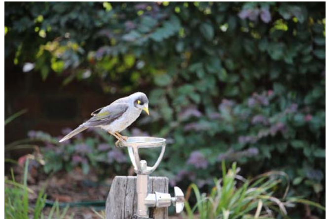
Photo B (the bird) was taken in a local park and allows me to appreciate the animal species that dwell in our glorious home, Australia. Whenever I see this photo, I always engross myself in the ‘design’ of this bird and how perfect all the details are.

I used to loathe rain because of how melancholic and sombre it appeared outside. However recently, I have learned to look beyond the sadness to see the silver lining; that is the blooming beauty of water in the natural environment. This is evident in photo A where it portrays the rain enhancing the beauty of nature as the rain droplets dazzle like tiny crystals. This beauty has not only thrilled me with how amazing our home is, it has also taught me that there is always an optimistic side to every situation, no matter how dreadful it may seem; you just have to look hard and take in account all the little things.