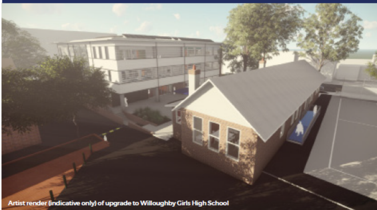
Artist render (indicative only) of upgrade to Willoughby Girls High School

The NSW Government is spending $8 billion over four years to deliver more than 170 new and upgraded schools. This includes an additional $160 million spend in 2018/19 as part of the record $747 million maintenance investment announced last year. This is the biggest investment in public school infrastructure in the history of NSW.