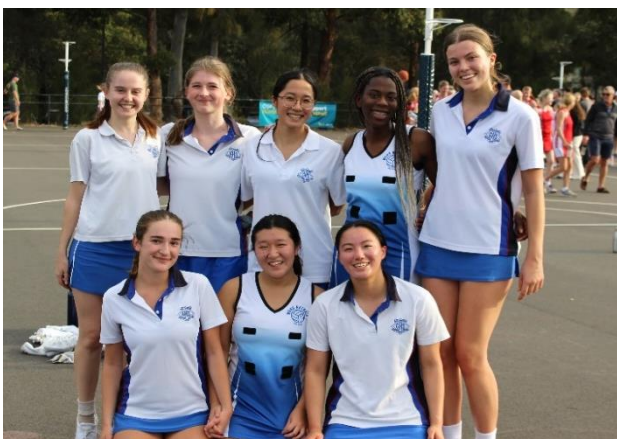
WGHS Team 02 – Ex-Students – Grade D2 Grand Final Winners