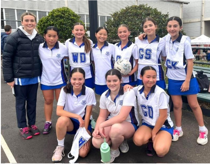
WGHS Team 17 – Year 7 - Grade 13C Elimination Finalists