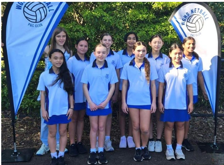
WGHS Team 19 – Year 7 - Grade 13F Finished 6/7