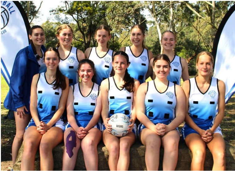
WGHS Team 05 – Years 10 – Inters 1 Finished – 6/8