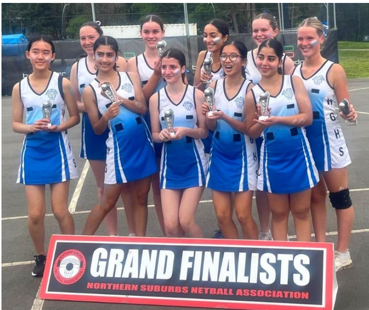
WGHS Team 07 – Year 10 - Inters 7 Grand Finalists – Runner Up