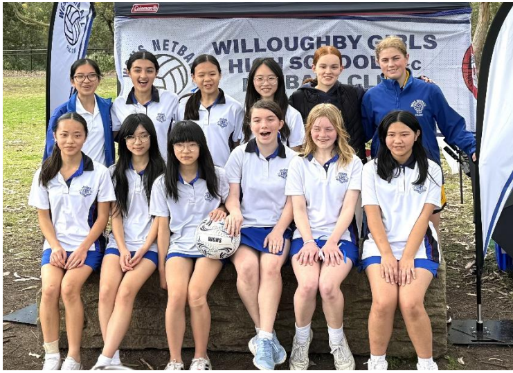
WGHS Team 23 – Year 7 - Grade 13H Preliminary Finalists