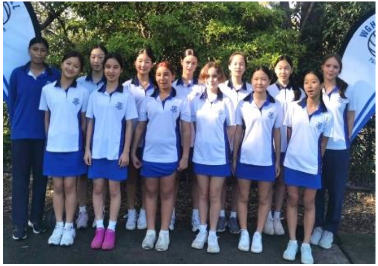
WGHS Team 22 – Year 7 - Grade 13H Finished 5/7