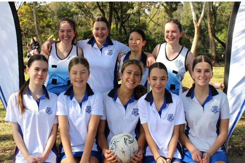
WGHS Team 13 – Year 8 - Grade 14E Finished 5/7