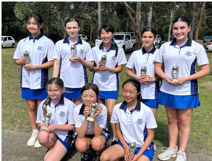
WGHS Team 21 – Year 7 - Grade 13H Grand Final Winners