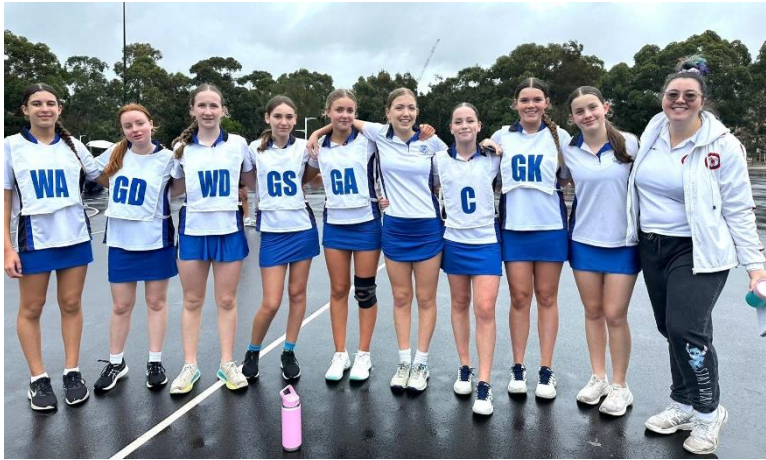
WGHS Team 11 – Year 8 - Grade 14C Grand Final Winners