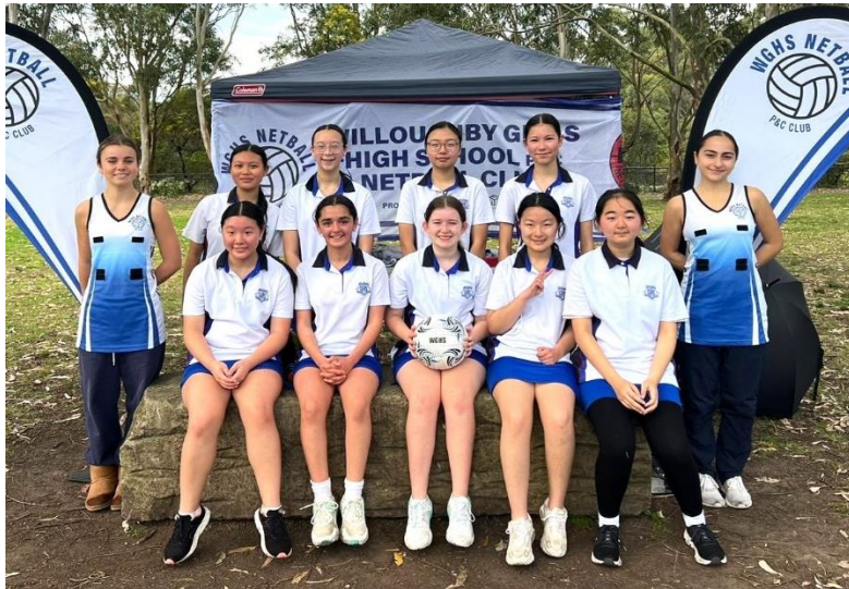
WGHS Team 15 – Year 8 - Grade 14H Finished 4/6