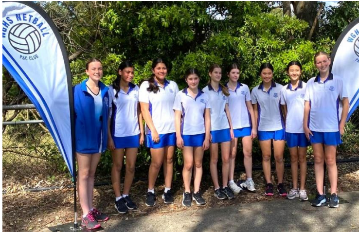
WGHS Team 09 – Year 9 - Grade 15E Finished 7/8