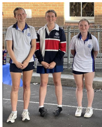
Netball Aust. National C Badge Umpires