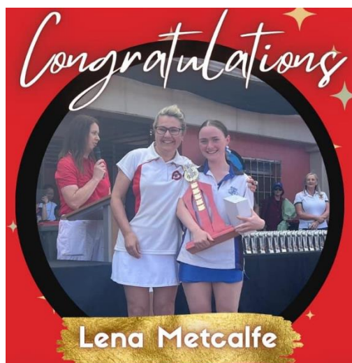
NSNA Junior Umpire of 2024