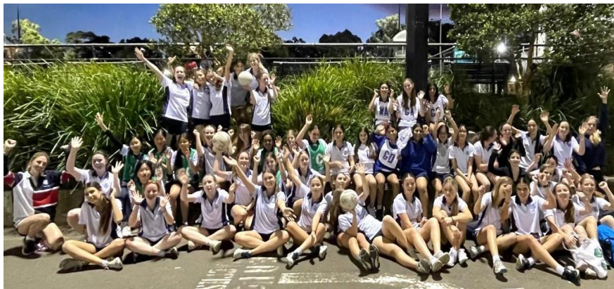
Years 9 – 12 Team Training Wednesdays 5pm – 6pm

We hope to see a number of you return for another successful season in 2025.