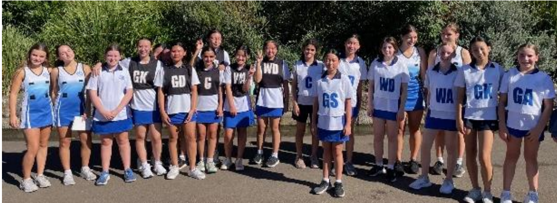
Teams 14 & 15 – Year 8

Camaraderie among the girls and their passion for netball was lovely to see. Many players went above and beyond, stepping up to assist teams in need and playing additional games on Saturdays to ensure their teammates had full teams. In particular, watching teams within the same grade compete against each other was a highlight, as the girls demonstrated both enthusiasm and a strong competitive spirit while having a great time.