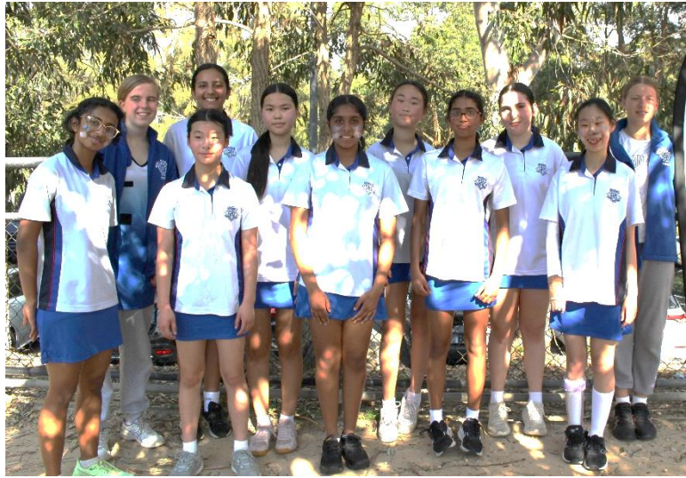
WGHS Team 16 – Year 8 - Grade 13G Grand Finalists – Runner Up