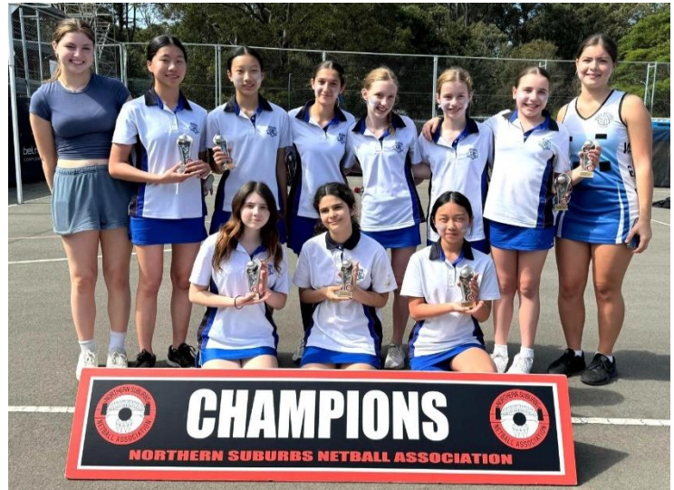
WGHS Team 14 – Year 8 - Grade 14H Grand Final Winners