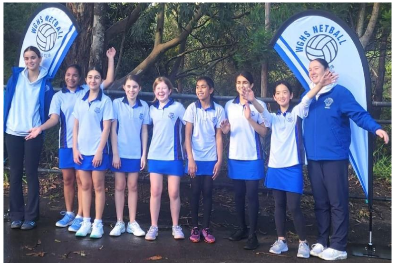
WGHS Team 20 – Year 7 - Grade 13G Finished 8/8