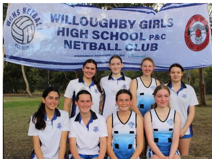
WGHS Team 03 - Year 11– Grade CD1 Grand Final Runner Up