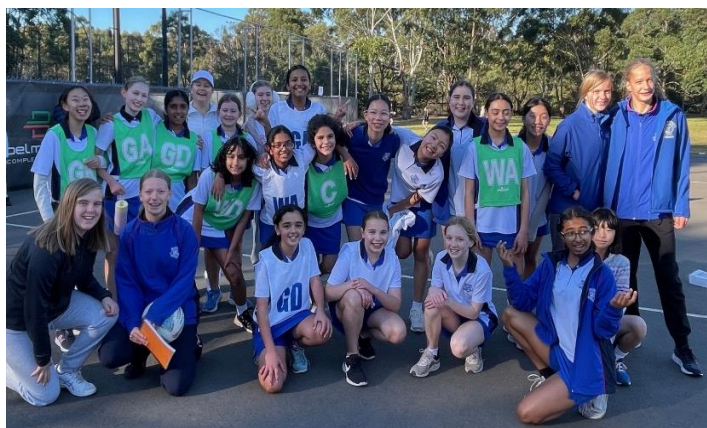
Teams 17 & 18 - Year 7

We congratulate all teams on their hard work and effort. Furthermore the camaraderie between the girls and love of netball demonstrated throughout our Club is to be commended and celebrated. Many players assisted teams who were short and backed up playing additional games on Saturdays so their school mates/peers would have a full team. And for divisions where we had 2 teams within the same grade, it was a joy and delight to watch the girls have so much fun yet still show a competitive spirit.