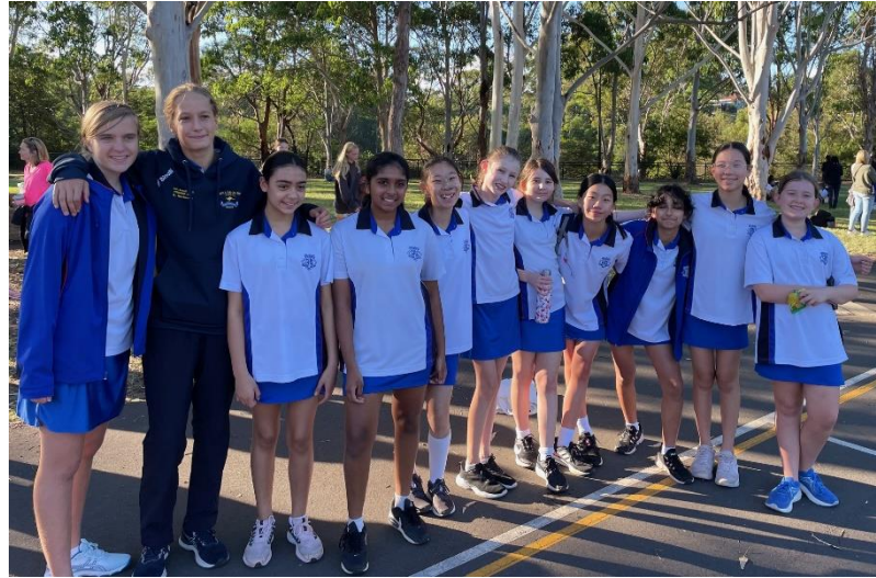
WGHS Team 17 – Year 7 - Grade 13H 5/7