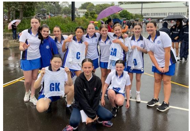
WGHS Team 15 – Year 7 - Grade 13E Semi Finals – 3/8