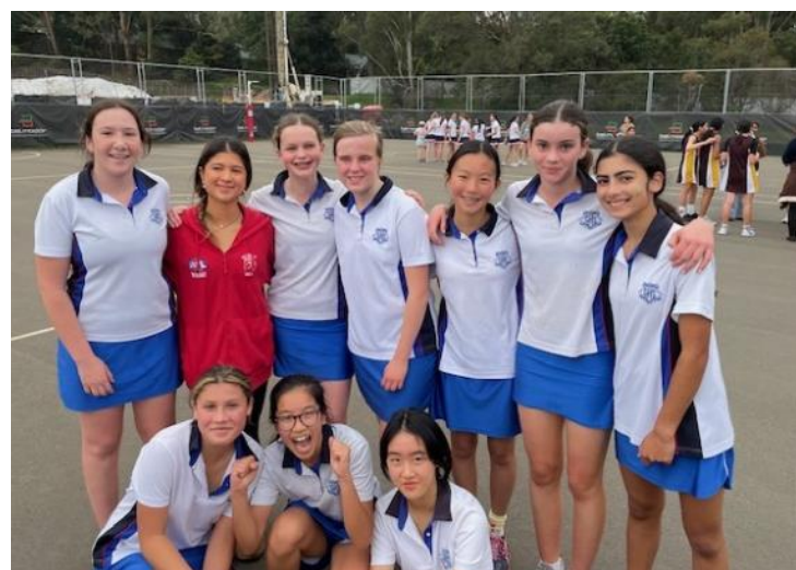
WGHS Team 08 – Year 9 - Grade 15F Grand Final Winners