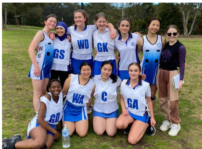
WGHS Team 02 – Year 12 - Grade D2 5/6