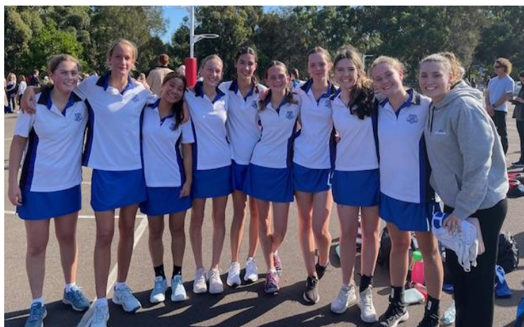
WGHS Team 06 – Year 9 - Grade 15B Grand Final Winners