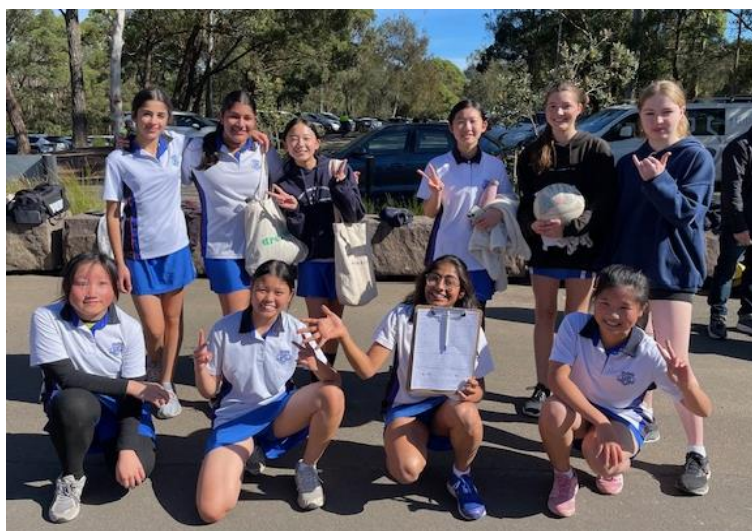
WGHS Team 12 – Year 8 - Grade 14G 5/6