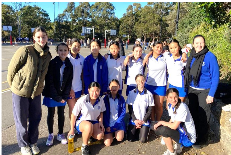
WGHS Team 16 – Year 7 - Grade 13G Regraded from 13F – 5/6