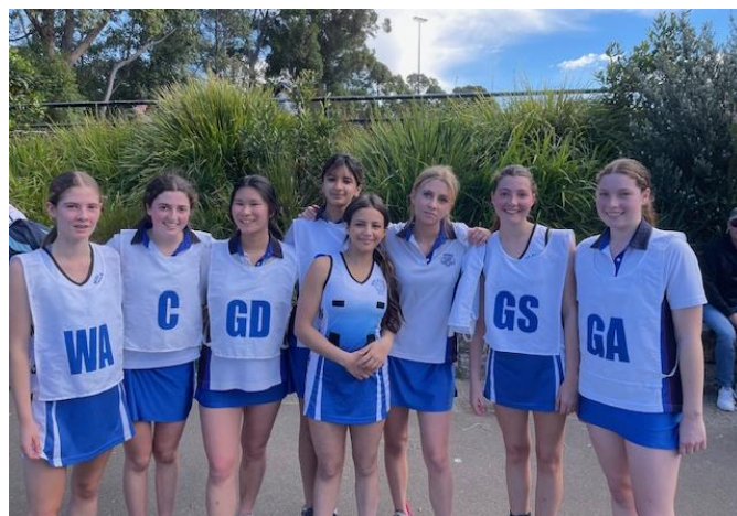
WGHS Team 05 – Years 10/11 Grade CD3 – 6/8