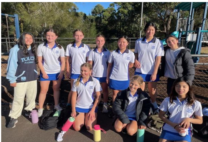
WGHS Team 14 – Year 7 - Grade 13D 5/8