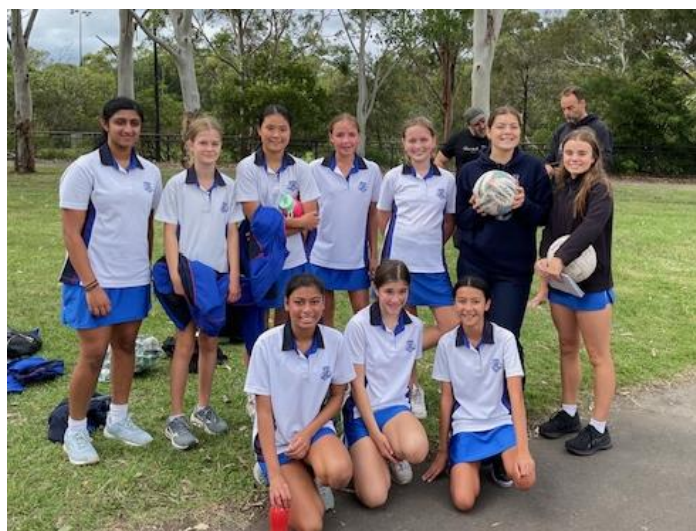
WGHS Team 11 – Grade 14G – Year 8 Grand Final Winners (Drawn)