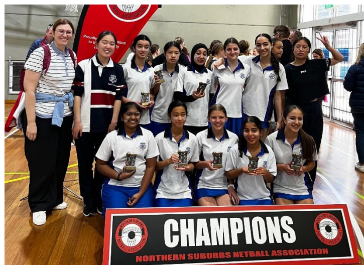
WGHS Team 09 – Year 9 - Grade 15G Grand Final Winners (Drawn)