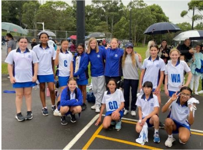
WGHS Team 18 – Year 7 - Grade 13H Semi Finals – 3/7