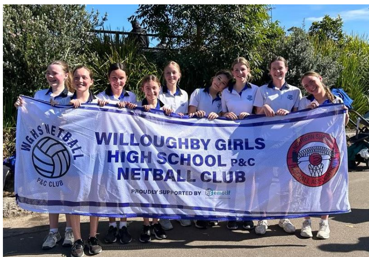
WGHS Team 10 – Year 8 - Grade 14D Grand Final Runner Up