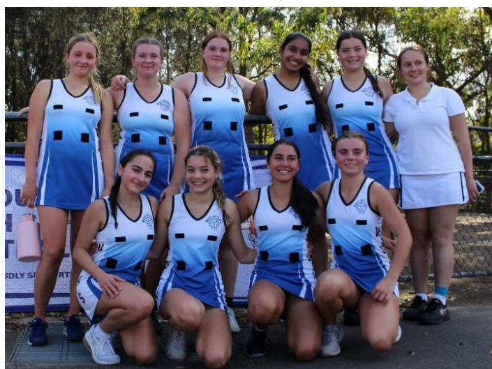
WGHS Team 04 – Year 10 - Grade Inters2 Prelim Finals – 3/8