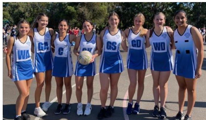
Team 04 wearing the new dress with match bibs